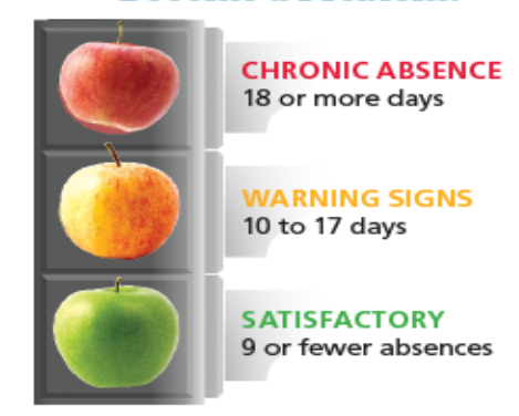
Note: These numbers assume a 180-day school year.